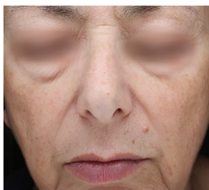
Photofractional™ treatment (Sequential treatment of IPL + ResurFX™), In-house clinic