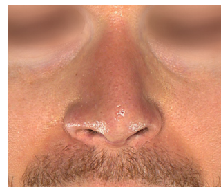
Treatment with IPL Vascular filter.